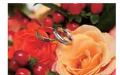
No waveform control