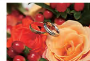
Waveform control applied

Mimaki's superior inkjet technology accurately places the ink droplets without losing their perfect circularity. This ensures that texts, lines, and edges are clearly and sharply printed.