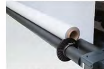
Easy media loading

Rolled media can be easily loaded because of a design improvement. This improvement provides increased safety and reduces the time for preparation.