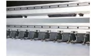
Newly designed pinch rollers

Newly designed pinch rollers are used for more accurate media transportation to provide high-quality printing.