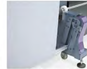
Tension release device