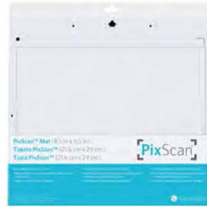
8.5 in. x 11.5 in. CAMEO PixScan™ Cutting Mat CUT-MAT-PIX12-3T