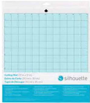
12 in. x 12 in. CAMEO Cutting Mat CUT-MAT-12-3T