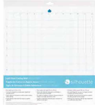
12 in. x 12 in. CAMEO Light Hold Cutting Mat CUT-MAT-12LT-3T